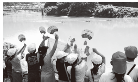
(July 2021) Poland's canoe team publicly practicing for the Tokyo Olympics. Children cheered for them using handmade fans of the Polish flag.

We will continue to promote projects with the aim of developing the exchange with Poland.